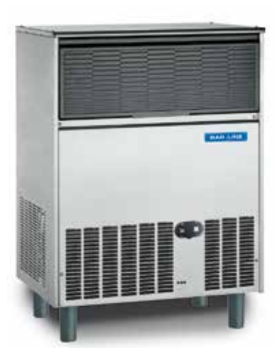
B 9550 AS/WS

Bar Line Equipment range is the newly released EU made ice makers for Thimble-shaped rounded ice cubes coming from Bar Line.